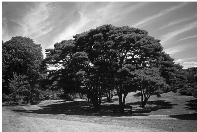
Figure 1. The open, horizontal branching of the Japanese red pine makes it an interesting tree for specimen planting.

The approximate mature height is given with each listing, although in some cases plants of these less common types are slow growing and may have their maximum use at much smaller sizes. The plant hardiness zone or zone range also is included, since some of these plants need protected locations or special attention in colder areas, or are not hardy throughout the