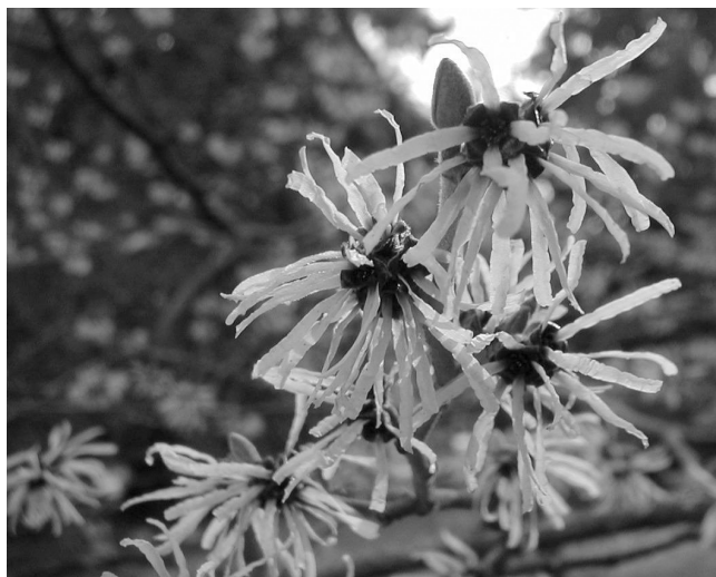
Figure 4. Chinese witchhazel.

More frequently thought of as a large shrub, this plant may also develop a treelike form. It is most useful for its yellow flowers, which are produced in February or March or sometimes earlier during a warm spell in winter (Figure 4). It is a close relative to our native witchhazel, but the plant is smaller and the flowers are more showy. As a tree, it becomes rounded in form and may be as broad as it is tall. The bark is smooth and gray, making it attractive in winter. This tree grows best in rich acid soils. It is an understory plant and should be grown in light shade. Although not a showy plant, it is useful for its unusual early flowering. There are no serious pest problems of witchhazel. Hybrids of this witchhazel with Japanese witchhazel ( Hamamelis x intermedia ), may be grown as either large shrubs or small trees and should be considered as interesting landscape specimens.