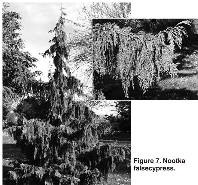
Figure 7. Nootka falsecypress.

This unusual evergreen from the pine family is extremely slow growing. The needles are flat leaves that are dark, glossy green and thick. The needles radiate around the stem, which provides the effect that gives the plant its name. It must be planted in rich, moist soil where it gets afternoon shade. Moisture must be maintained during drought periods, but good drainage to prevent excess moisture buildup is important. This unusual small tree takes some pampering in the Missouri climate.