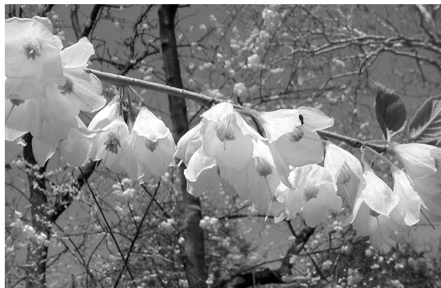
Figure 3. Carolina silverbell.

A beautiful flowering tree that may suffer in colder climates subject to rapid temperature changes. In colder areas, it should be placed in a somewhat protected location. It needs well-drained, rich acid soil and is a good companion tree in areas suitable for azaleas and rhododendrons in the landscape. It can tolerate some shade and needs water during drought periods. Its most attractive feature is the white bell-shaped flowers that are produced abundantly in spring (Figure 3). Flowers hang like bells, but they are effective for only