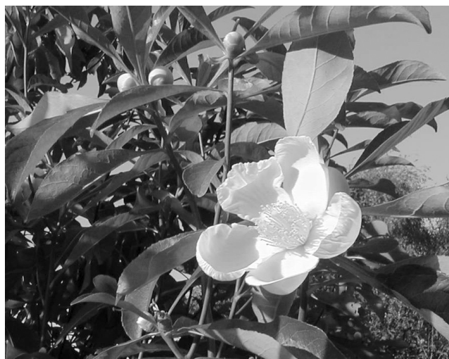
Figure 5. Franklinia.

A difficult plant for Missouri's climate, Franklinia is somewhat difficult to transplant and should be